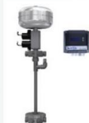
Station and Controller